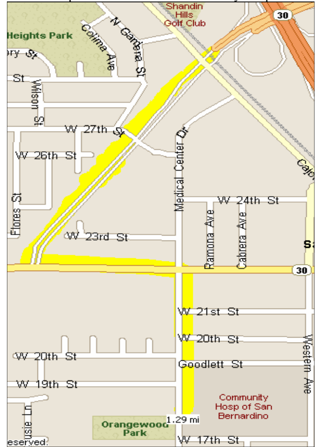
Close up of San Bernardino Community Hospital

(not on map) Kaiser Permanente Medical Center 9961 Sierra Avenue, Fontana, CA (909) 427-5000